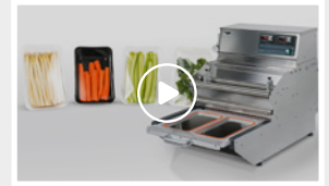
BS 5 ECO: Tray Sealing Device for Vegetables and Asparagus